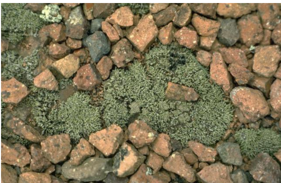
Fig. 3: ' Bryum argenteum ' by Lepp, H. (  Lepp, H.)