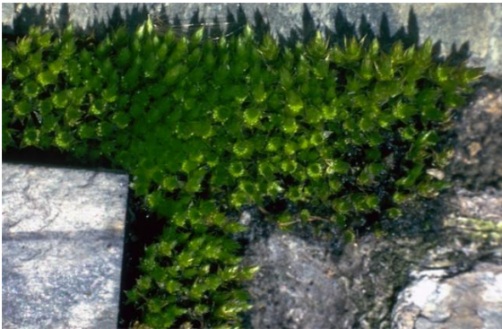
Fig. 7: ' Bryum sp. ' by Lepp, H. (  Lepp, H.)