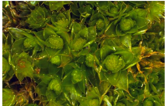
Fig. 2: ' Rosulabryum billarderi ' by Lepp, H. (  Lepp, H.)