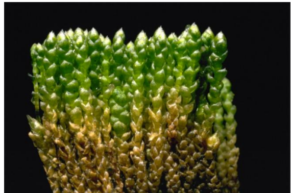
Fig. 6: ' Bryum argenteum ' by Lepp, H. (  Lepp, H.)