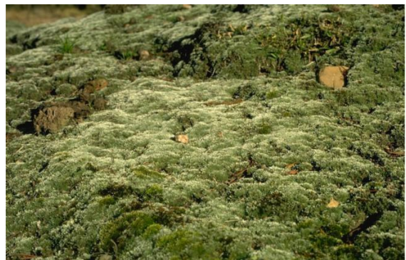
Fig. 4: ' Bryum argenteum ' by Lepp, H. (  Lepp, H.)