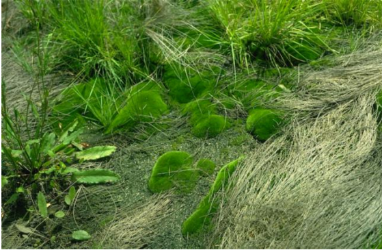
Fig. 1: ' Gemmabryum dichotomum ' by Lepp, H. (  Lepp, H.)