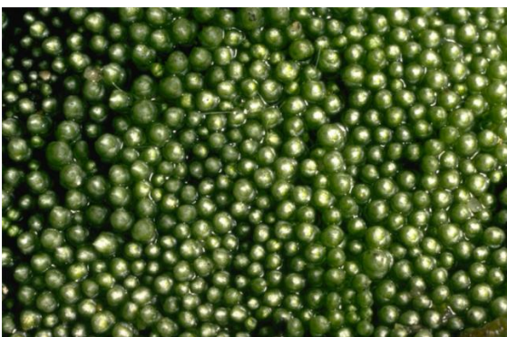
Fig. 5: ' Bryum argenteum ' by Lepp, H. (  Lepp, H.)