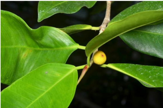
Fig. 13: ' Ficus microcarpa var. hillii ' by Fagg, M. (© Fagg, M.)