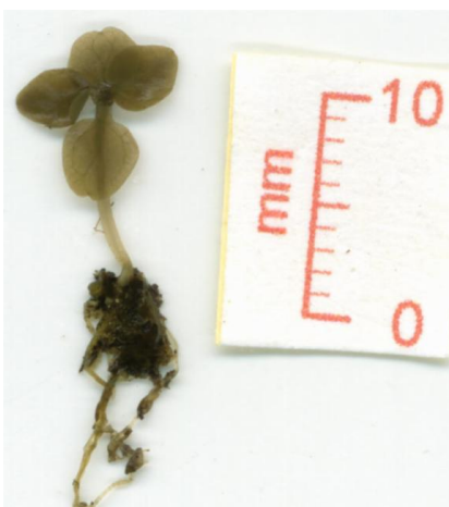
Fig. 11: ' Ficus microcarpa ' by Unknown (© Centre for National Biodiversity Research)