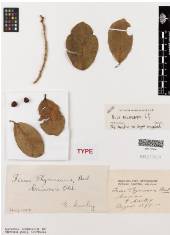
Fig. 15: ' Ficus microcarpa ' by Royal Botanic Gardens Victoria (© Royal Botanic Gardens Board)