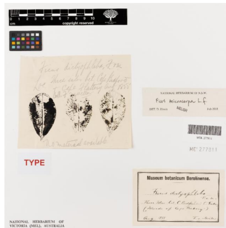
Fig. 10: ' Ficus microcarpa ' by Royal Botanic Gardens Victoria (© Royal Botanic Gardens Board)