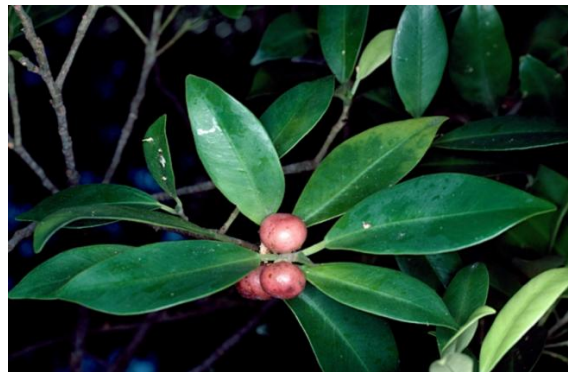
Fig. 8: ' Ficus microcarpa ' by Fagg, M. (© Fagg, M.)