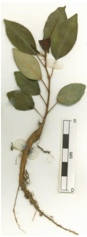
Fig. 5: ' Ficus microcarpa ' by Unknown (© Australian National Botanic Gardens)