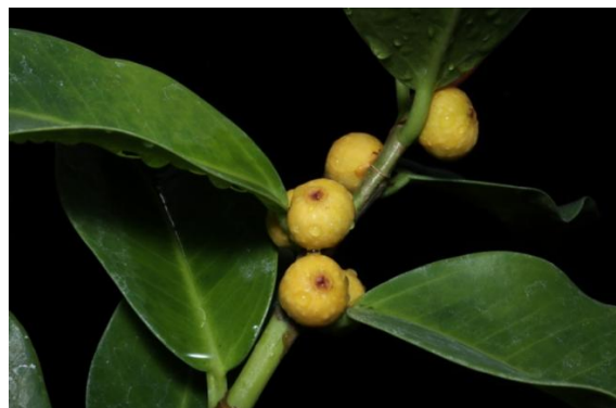
Fig. 12: ' Ficus microcarpa ' by Fagg, M. (© Fagg, M.)