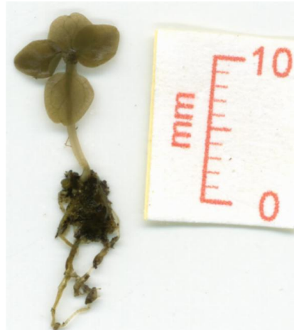
Fig. 2: ' Ficus microcarpa ' by Unknown (© Australian National Botanic Gardens)