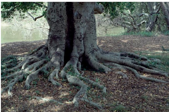
Fig. 9: ' Ficus microcarpa ' by Fagg, M. (© Fagg, M.)