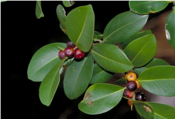
Fig. 1: ' Ficus microcarpa ' by Unknown (© Australian National Botanic Gardens)