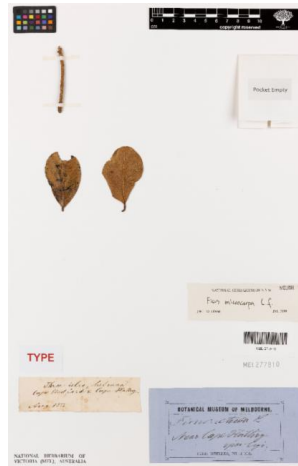
Fig. 14: ' Ficus retusa ' by Royal Botanic Gardens Victoria (© Royal Botanic Gardens Board)