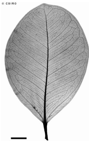
Fig. 7: ' Ficus microcarpa ' by Unknown (© Centre for National Biodiversity Research)